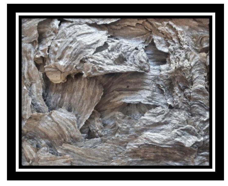
Figure 5: Shroud of comfort (Wasp paper)

The power of creating art was dominant, real, tactile, and vibrant. I sensed moving from shame and guilt and aimed to bring life to my effort to be a self-compassionate researcher. When writing and creating art the tensions of shame slowly drifted past, quietly they moved away into the deep shade of the trees. I felt I was gaining new insights into being a reflexive researcher (Finlay, 2022). I returned to the wasp paper creation and carefully placed each piece into a deeply walled box. I named the work Shroud of Comfort (See Figure 5). When gently layered, the wasp paper reflected my need for emotional comfort, kindness, and a blanket of healing (Dewey, 1958). The paper was soft, flexible, imperfect and the previously noted mustiness had faded; the symbolic meaning was deeply felt (Finlay, 2014). Wasps had worked to create a nest that lasts a season, and I am benefiting from their creation to enrich my "road to recovery" (van der Kolk, 2014, p. 137). Finally, in relation to the use of art, Chan (2019) states that creating alongside efforts to heal from an eating disorder renders the artist- individual, with a voice, not mute. One becomes able to sense and embody the healing that is occurring. The wasp paper, which was stagnant and devoid of life, in turn provided comfort, a shrouding and a space to reflect and grow.