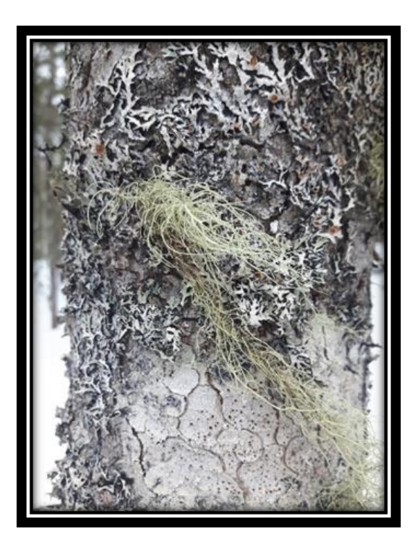
Figure 2: Reflexivity as a complex, living organism

To visualize reflexivity, I hiked into the bush with my camera. Blowing in the wind were grey, verdant green lichens known as Old Man's Beard (Usnea trichodea) each gently wrapped around the trees. I was standing in and surrounded by dense sea fog; it reminded me of reflexivity, woven, threaded around us as researchers (See Figure 2 - Reflexivity as a Complex Living Organism). The lichens are multifaceted organisms (Brodo et al., 2001) that respond to air quality and monitor the ecological integrity of a forest area (Nova Scotia Forest, 2016). This reminded me that my bodily movements (hiking, eyes viewing trees, raising arms to photograph) were my embodied reflexive activities. It also reminded me that I do not research in isolation; I research from within, without, alongside the academic community, society, and the earth (Dewey, 1934).