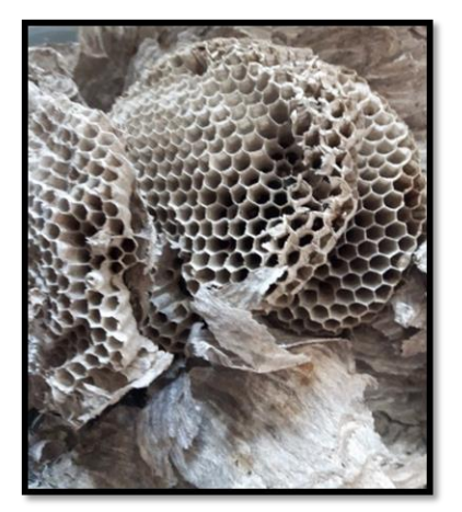
Figure 4: Complex pockets of life (Wasp nest)

I needed to create art in response to these new understandings. I headed out on my snowshoes and later wrote the following: "Today while hiking I came upon a large wasp nest hanging from the limb of a maple tree, thirty-five feet above the path, I wondered if I could retrieve the nest?" ( Reflexive journal , January 2021). I tentatively crawled up a tall ladder and using a long pole, dislodged the vacated nest to the earth. Inside I excitedly exposed three layers of hexagon-shaped paper, each held with a firm stalk (the cells are created from wasp activity, wood cellulose and saliva) (See Figure 4) (Sciencing, 2021).